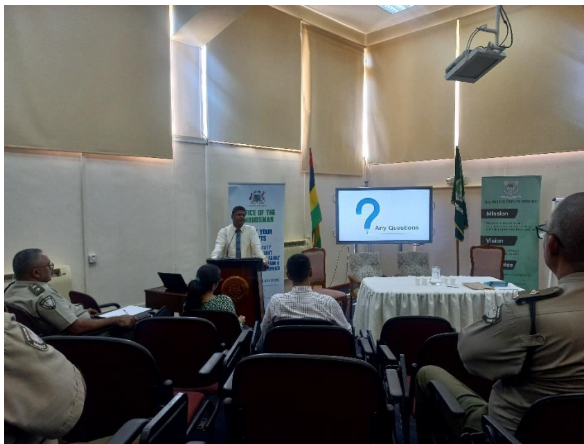
Interactive session with the Senior Investigations Officer