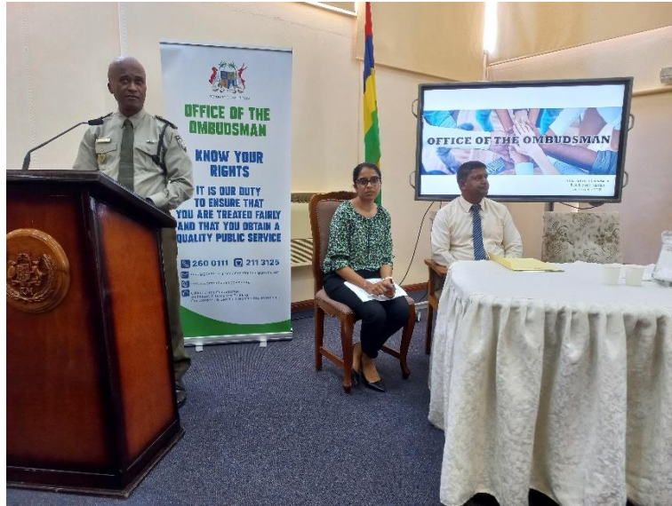
Welcome Address by Lead Prison Officer